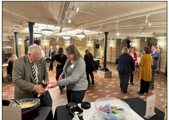
Minnesota school nutrition representatives participating in MSNA's Day at the Capitol event