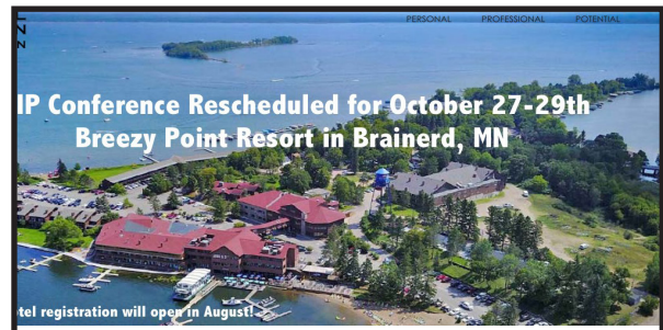
Breezy Point Resort Breezy Point MN