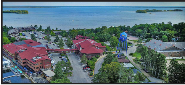
Breezy Point Resort Breezy Point MN

Plans are moving forward for the 2021 SNIP conference May 6-8 2021 at Breezy Point Resort, Breezy Point MN. In light of current COVID-19 concerns, MSNA will follow state and national recommendations and have safety protocols in place for all who attend.