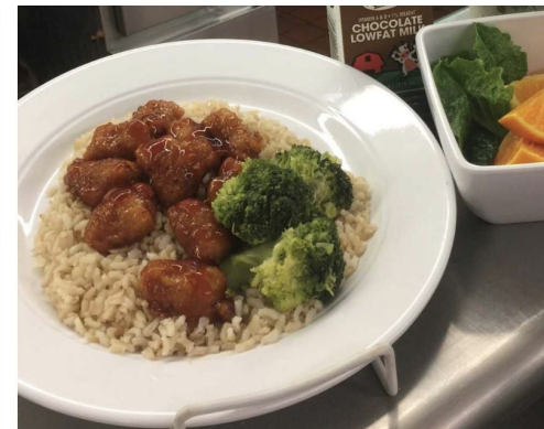
General Tso Chicken Bowl