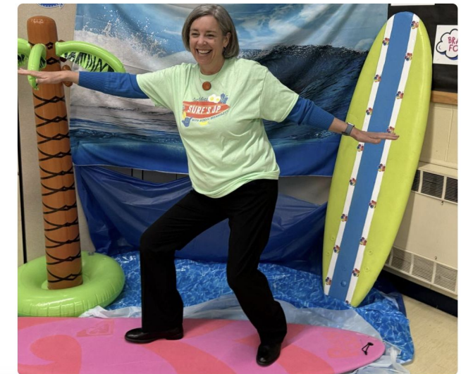
Mitchell School kicked off National School Breakfast Week #NSBW

Submitting a headshot doesn't give any more background or visually add to the story. Don't forget opportunities like professional accolades, awards or even fun photos that show how engaged school administrators or nutrition staff are in their cafeterias.