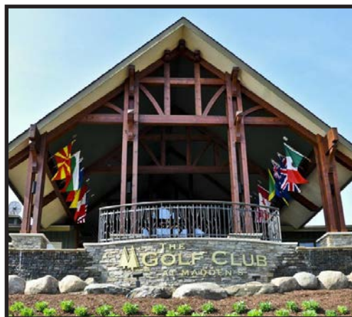
Madden's Resort 11266 Pine Beach Peninsula, Brainerd, MN www.maddens.com